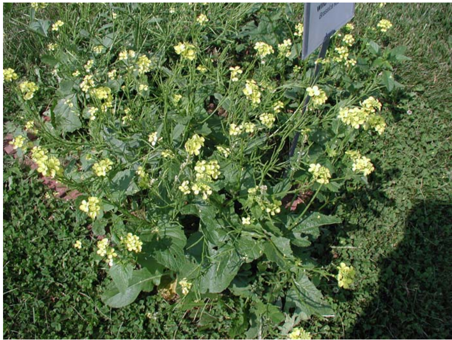
Flowering plants. Key characteristics: flowers are yellow, occur in clusters and each individual contains four petals.