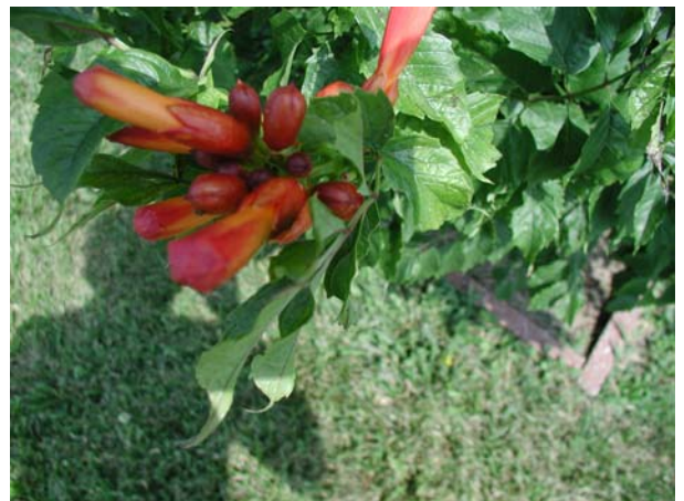
Flowers. Key characteristics: large and tubular, bright orange in color.