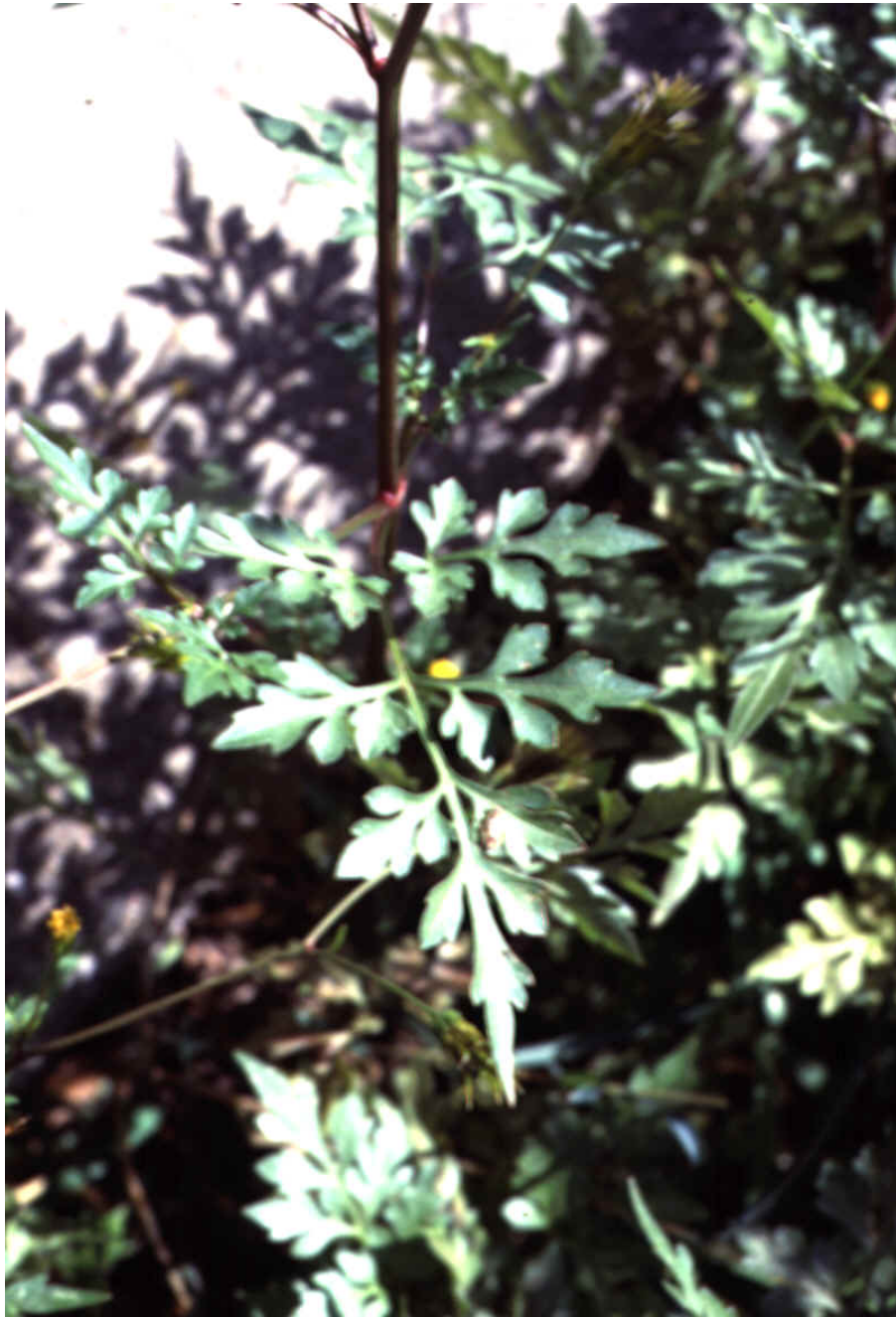
Foliage. Key characteristics: pinnately dissected.