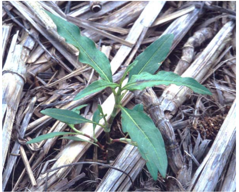
Vegetative plants. Key characteristics: leaves are alternate and often have purple watermark on their surfaces.