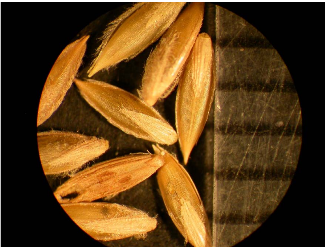
Seed. Seed are covered with hair and are approximately 3.0 mm long.