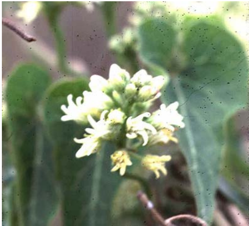
Flower. Greenish-white in color.