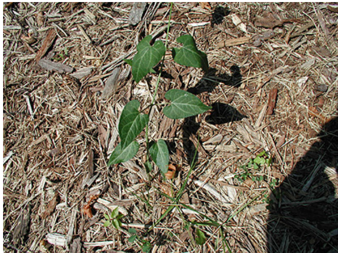
Vegetative growth. Key characteristics: vining habit, opposite leaves which are heart-shaped and have basal lobes.