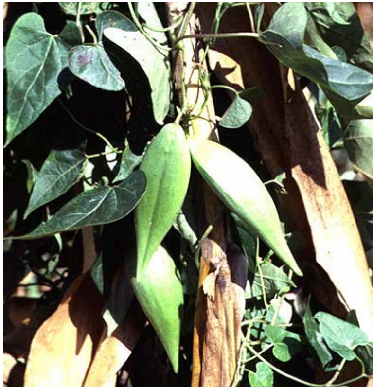
Fruit. At maturity, fruit splits in half. It has a tapered apex and an "angle-pod" appearance.