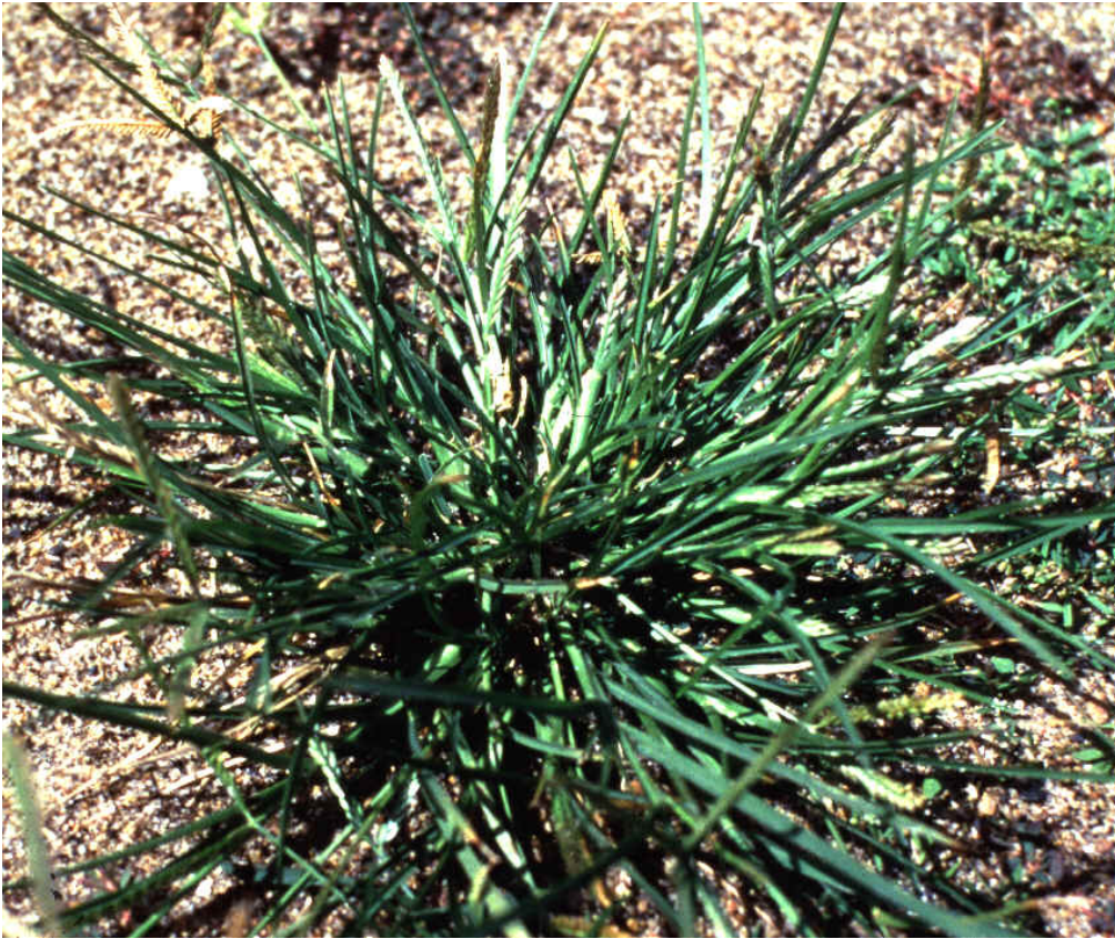
Tillering plant. Key characteristics: tillers are arranged in a spoke-like fashion, distinctly flattened and have a whitish coloration at the base.