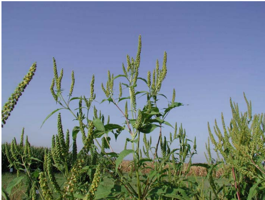
Flowers. Giant ragweed is a major contributor of pollen and is partly responsible for allergy problems in the late summer.