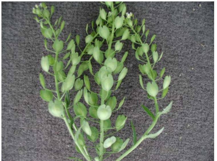
Fruit. Key characteristics: fruit is flattened and round with a small notch in its upper portion.