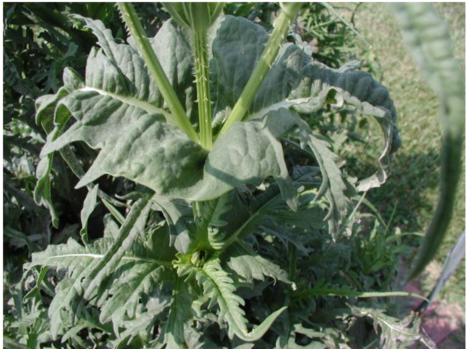
Stem section. After bolting, the stem is covered with short, stout spines.