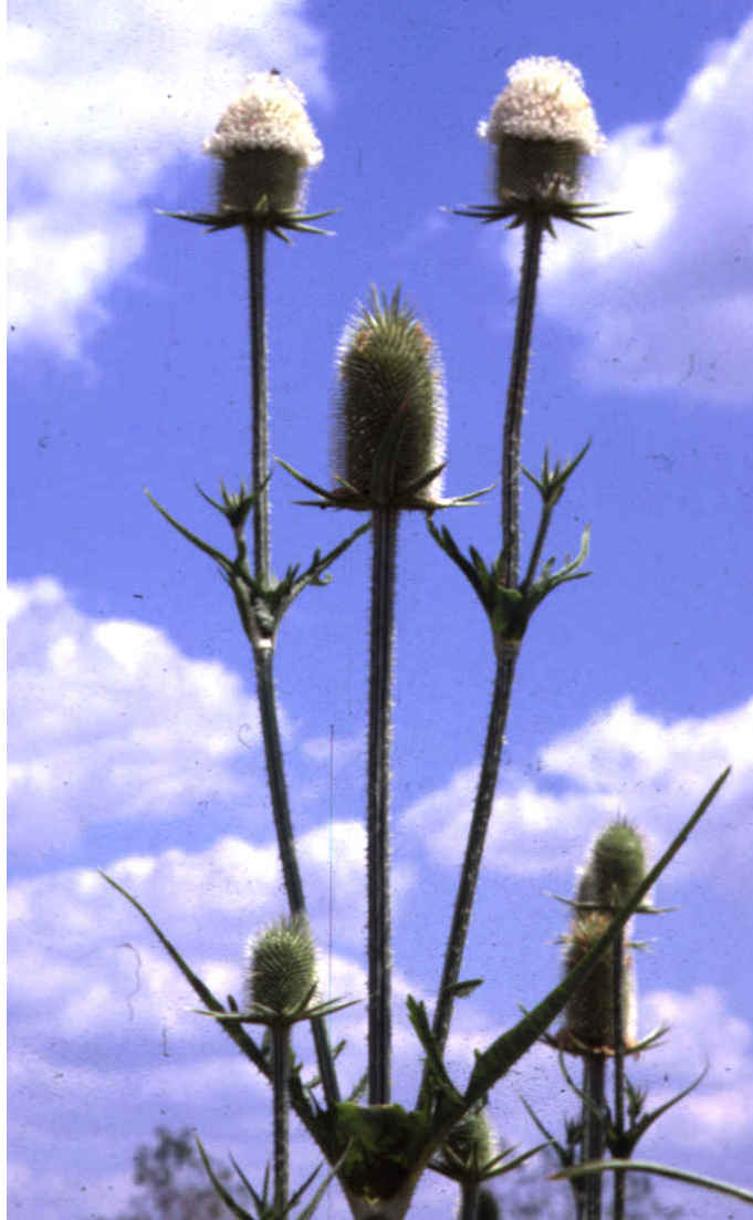
Flowers. Key characteristics: "cup-cake-shaped." Spiny bracts subtend the base of the flower.