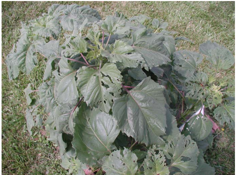
Foliage. Key characteristics: as the plant develops, leaves become heart-shaped and contain three major veins.