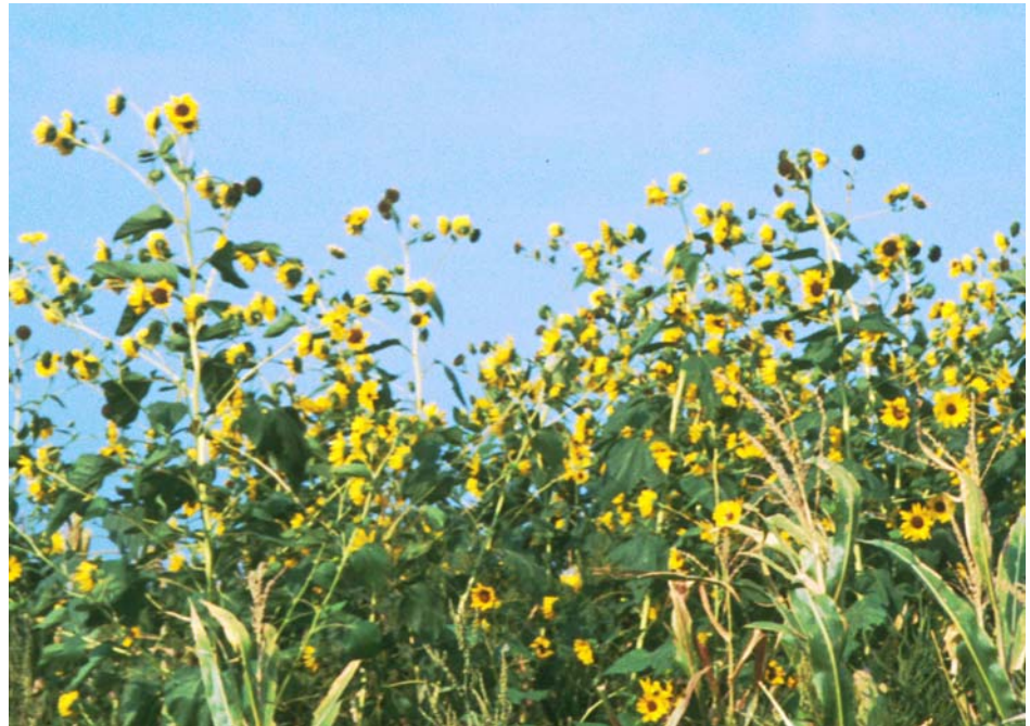
Flower and infested corn crop.