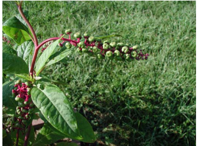
Fruit. Key characteristics: berry-like and black when mature.