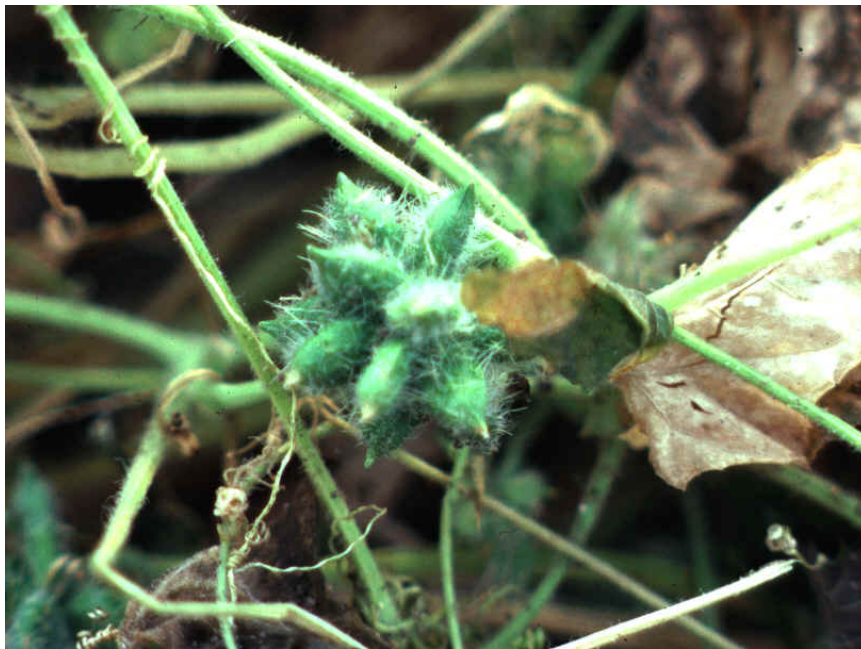
Fruit. Key characteristics: occur in clusters, are pointed and covered with hairs.